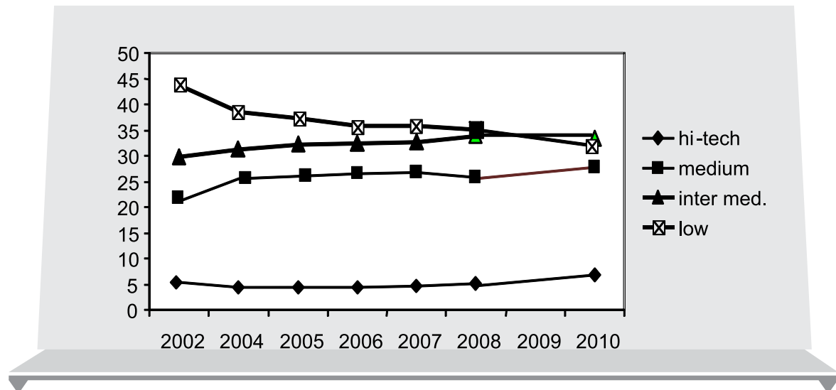
Figure 1. Structure of industrial output by level of technology

Center believes that ‘... the number of scientists in Polish industry is dramatically low. You have to associate the leading companies with research centers ...’ (2012). More and more companies invest in ambitious projects.