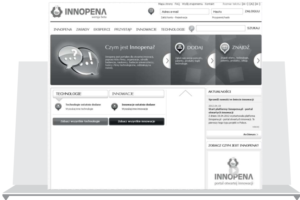
Figure 3. The home page of INNOPENA platform

The platform is to improve information exchange and communication between entities, especially small and medium size, mating the partners of economic sector with R&D (universities, Academy of Sciences, research and developments units) for mutual and faster completion of development and innovative projects in enterprises.